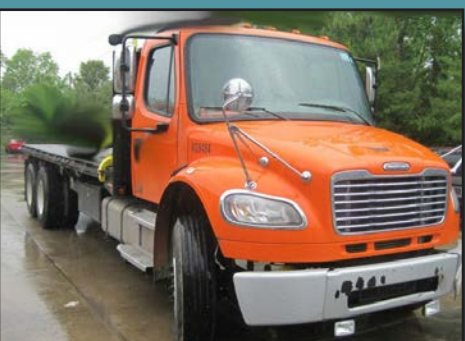
2010 FREIGHTLINER M2 Flat Bed Cummins ISC/330hp, 10 speed transmission, 14,600# front axle, 40,000# rears on spring suspension, 22.5 flat bed, Moffett hook ups, 22.5 rubber, 4.88 ratio, 260" w.b.