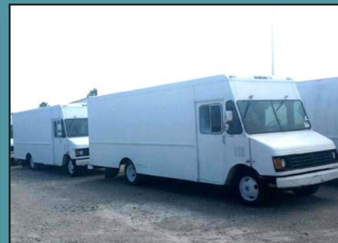
Group of 1999 Thru 2003 CHEVROLET P30 V8 Diesel, automatic transmission, spring suspension, 18' cargo, some inops