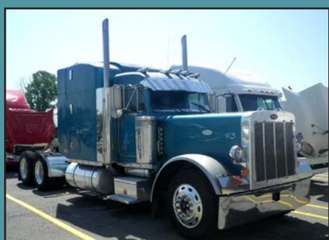
1998 PETERBILT 379 Cummins N-14/435hp w/engine brake, 13 speed transmission, 63" Unibilt sleeper, 12,000# front axle, 40,000# rears on air ride suspension, 260" w.b.