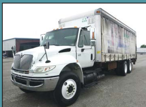
2007 INTERNATIONAL 4400 Curtin Side IHC DT570/310hp, 10 speed transmission, 12,000# front axle, 40,000# rears on air ride suspension, 24' Curtin side, roll up rear door, lift gate, 255" w.b.