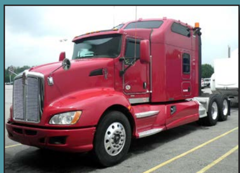
2012 KENWORTH T660 Cummins ISX/450hp w/engine brake, 10 speed transmission, VIT Interior, 86" Studio sleeper, 12,000# front axle, 40,000# rears on air ride suspension, air slide 5th wheel, aluminum wheels, aluminum Headache Rack, power windows & locks, tilt/tele, cruise control, 245" w.b.