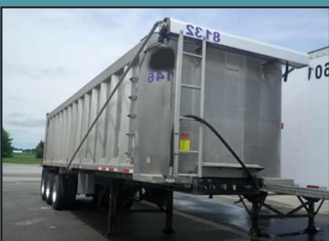
(2) 2011 TRANSCRAFT Tri Axle Dump 35' x 102", spring suspension, aluminum wheels, electric roll tarp