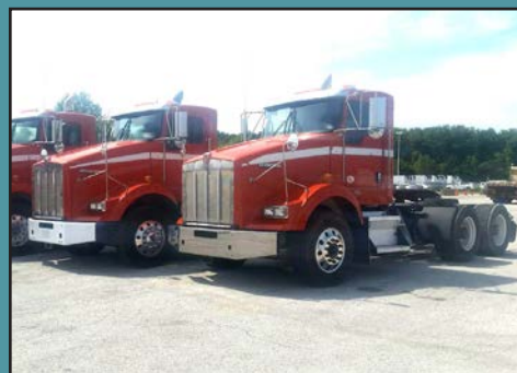
Group of 2010 KENWORTH T800 Day Cabs Cummins ISX/425hp w/engine brake, 10 speed transmission, 12,000# front axle, 34,000# rears on air ride suspension, air slide 5th wheel, aluminum wheels, tilt/tele, cruise control, 174" w.b.