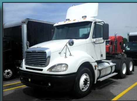
2005 FREIGHTLINER FCL12064ST Day Cab Detroit 14.0L/455hp w/engine brake, 10 speed transmission, 12,000# front axle, 40,000# rears on air ride suspension, air slide 5th wheel, dual 120 gallon fuel tanks, 171" w.b.